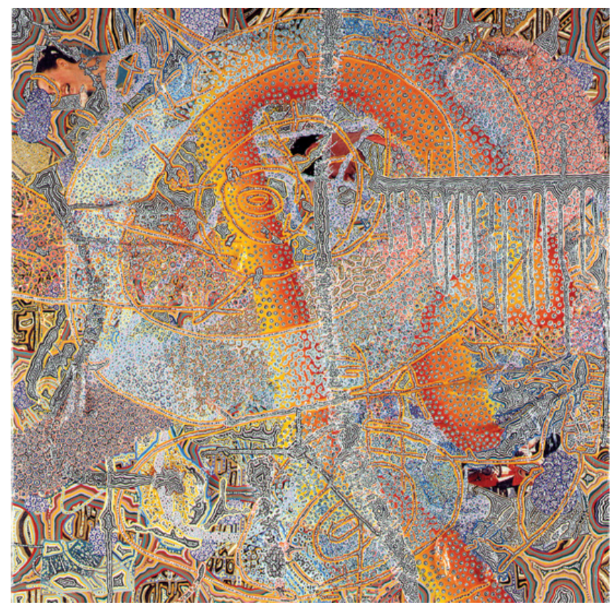
Icemur, 2005, enamel, modeling paste and collage on canvas, 20 × 20 inches.

Charles's process emerges from an obsessive impulse that both frees and compels him to take as much time as the painting demands, sometimes two years. Time spent on a painting has often been seen as the concern of people who don't know anything about art, who can't see the ideas in art, but in 2006, when there are so many demands on our time, time spent making each painting makes Charles's studio practice into a kind of extremely radical solitary performance. His paintings are reminiscent of aerial maps or the infinitely complex circuitry of a computerized world, but coupled with the thick turgid quality of the paint (the clumsiest of mediums), time is made visible, literal and material.