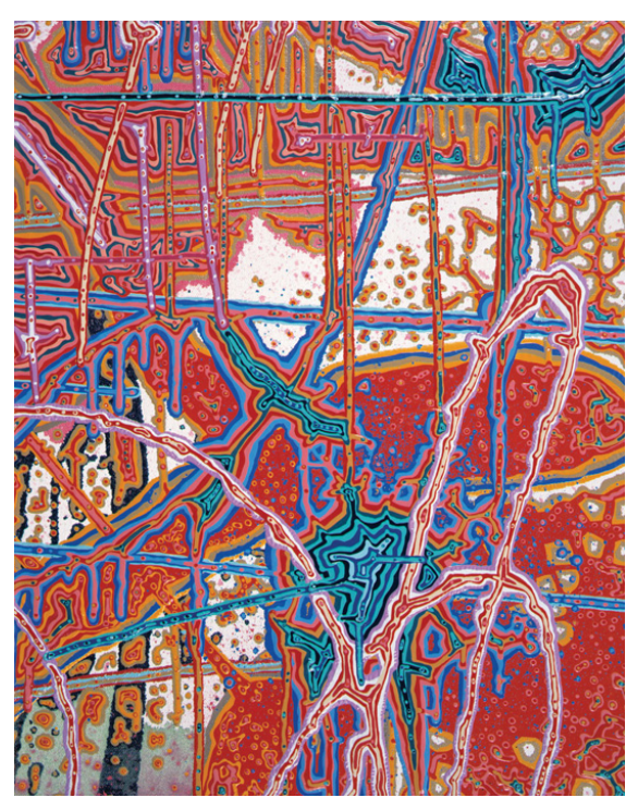
Eifoinbysetwin (with detail), 2003, enamel and collage on canvas, 84 x 72 inches.

Charles starts his paintings with anything at all, simple painted shapes of animals and other images, or collaged materials of all sorts and big fat spills of paint, which liver when dry, providing a complex, wrinkled terrain that he then covers with tiny lines and dots of sign-painter's enamel, squeezed from little bottles. Charles's relentless dividing of the canvas transforms it into a constantly changing, shadowed, shallow space. I listened to some of the music he likes (noise-punk bands like Lightning Bolt), walls of sound in which patterns emerge and fade like the rhythms of war felt and heard beneath water.