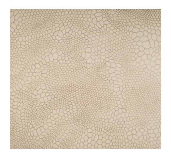
Tathātā , 2016 78 x 84 inches oil on canvas