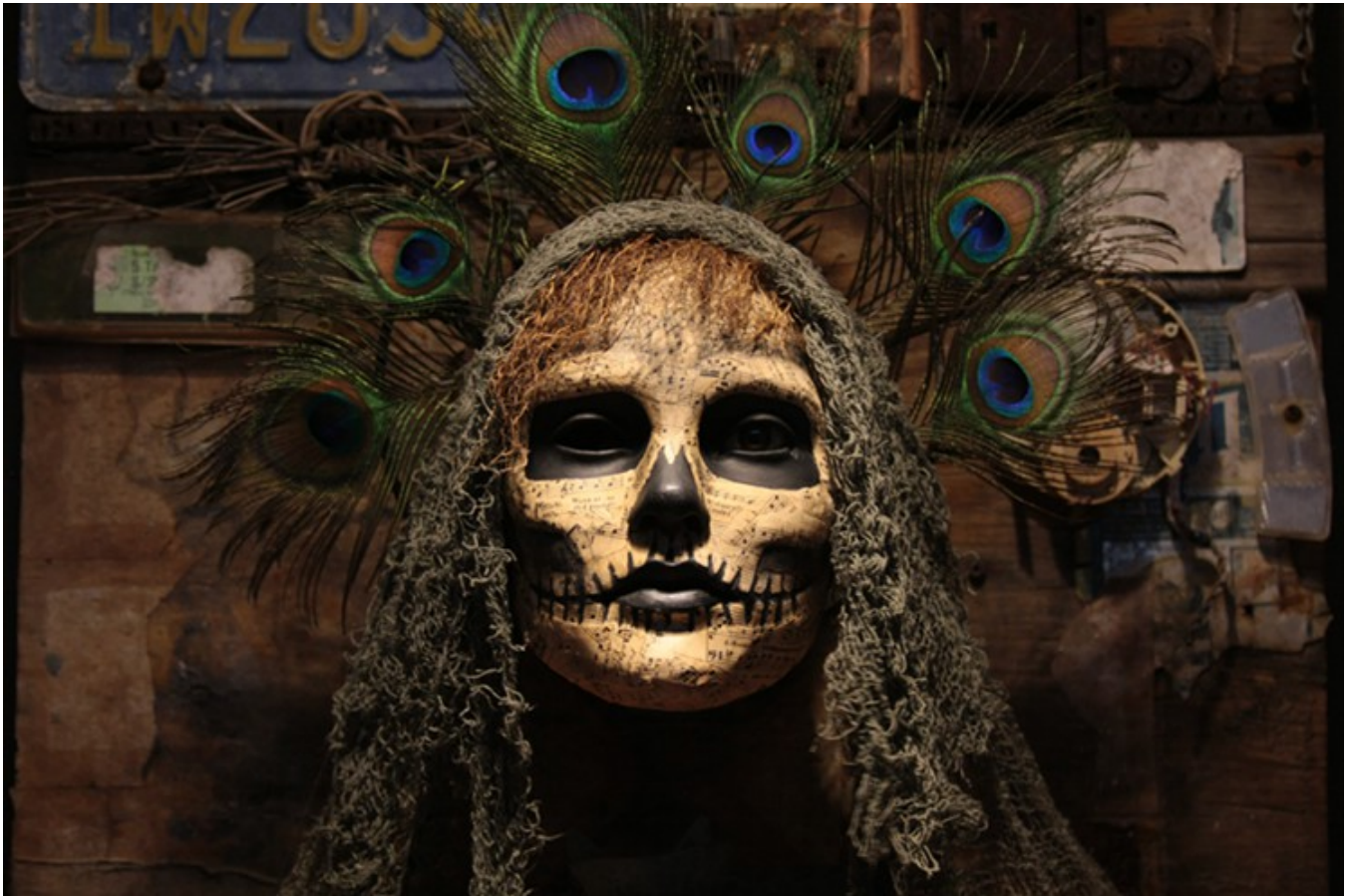
Embodied Ghost, by Robert Dampier (Galveston), is featured in The Art of Found Objects: Interviews With Texas Artists . The artist was swindled by a Houston gallery in 2003 and now works exclusively with collectors and fans. Photo by Robert Dampier

It takes an artist's eye to open the kitchen junk drawer and see the potential for something more, arranging random odds and ends until they take on a new incarnation as assemblage or sculpture. A new book by Robert Craig Bunch offers a brief history of some of the earliest adopters of found materials over the past century, before leading into a series of interviews with 64 contemporary Texas artists. For art world insiders, The Art of Found Objects: Interviews With Texas Artists is a veritable Who's Who of prominent local