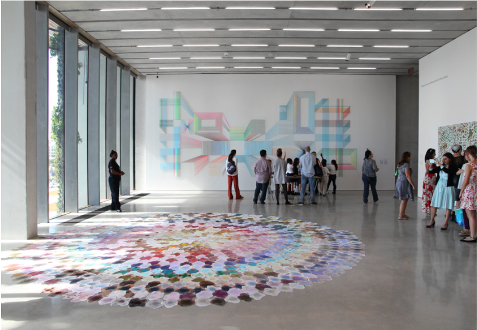
Visitors interact with the encompassing artwork within the space