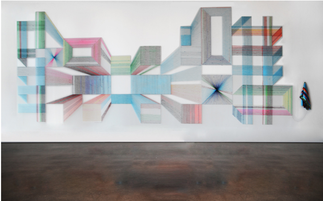
Adrian Esparza, Wake and Wonder , 2013, serape and nails, image © designboom

With his new work commissioned by the Pérez Art Museum in Miami, Texas-based artist Adrian Esparza addresses his experience as a Mexican-American raised on the border of the neighboring lands. His exhibited piece 'wake and wonder' is formed from a serape blanket — a traditional craft object from Mexico — pulled apart at its threads and rewoven around nails hammered into the walls of the gallery it occupies. The engaging linear structure creates multi-dimensional, vibrantly colored layers within the space. Esparza considers this installation as an evolving self-portrait; the long shawls represent a tradition, and a cultural identity, which has been displaced or lost from its site of origin. At the same time, the geometric patterning and materials of the mounted wall-piece recall macramé and other handcrafts from the artist's childhood. The artwork is part of the exhibition 'Americana: Formalizing Craft' from now until May 2015.