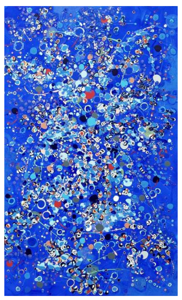
'Off In Space', 2017, acrylic on canvas, 60h x 36w in

Cathedral. Only Smith still feels more deliberate and careful, although no less intuitive.