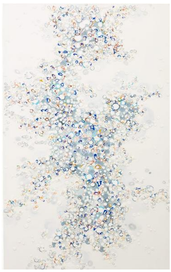
So Light, 2017, acrylic on canvas, 60h x 36w in

predators. Of course, Smith's little dots of paint don't fear being eaten, but the clustering of her dots simulates a similar effect. Her painted dots indicate movement and imply something emerging. Her paintings imply something bigger and more organized. We just can't see the whole picture.