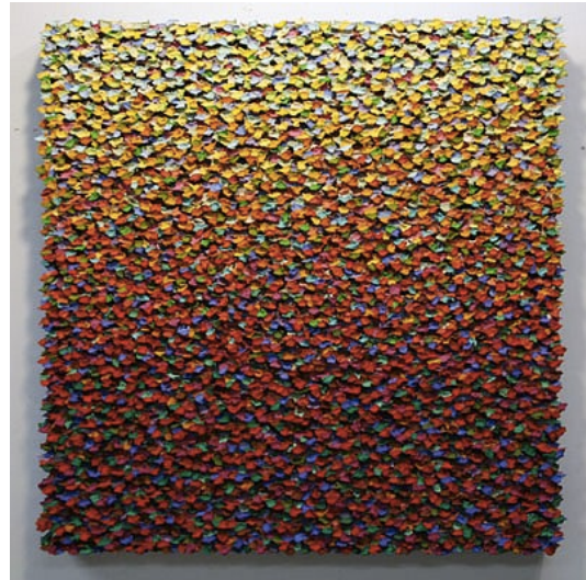
LEFT: "21,076" by Robert Sagerman 2011, Oil on canvas, 60 x 54 inches (153 x 138 cm) RIGHT: "5,105" by Robert Sagerman 2011, Oil on canvas, 26 X 25 inches (67 x 64 cm)

Margaret Thatcher Projects is currently exhibiting the eye popping and mesmerizing works by Robert Sagerman. Sagerman's work consists of intense sculptural color daubs. He builds up the lush surfaces by carefully applying thousands of thick strokes of oil paint to the canvas.