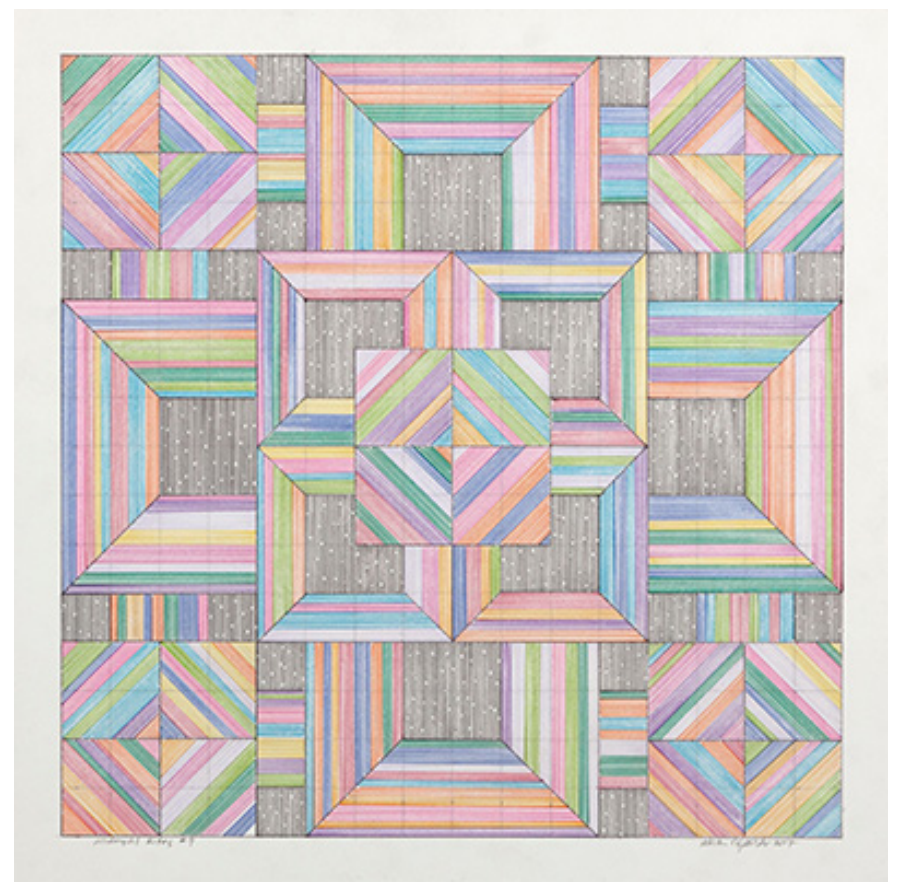
Adrian Esparza, Midnight Kite #9 , 2017 pen on paper, 18h x 18w in

Esparza's duality as a Mexican-American individual living along the border to the transformation of the sarape from a cultural icon to something utterly new.