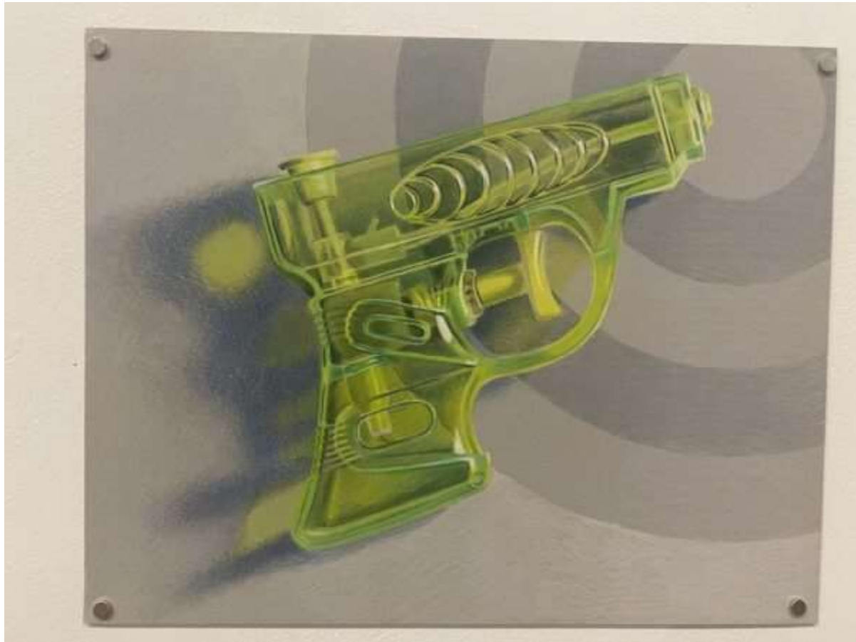
Work by Shannon Cannings

Take Double Vision, an 11 x 14-inch color pencil drawing of overlapping targets on drab gray paper. There is a hypnotic push and pull of the blue and grey circles — moments where the circles become each other's drop shadows, then suddenly spring back into flatness. The piece is attention-grabbing and bleak, as it should be. Its wall-mate, forming a sort of diptych, is Cosmic, a grayscale (with a bit of blue) drawing of the same size of a clear, plastic, cosmic toy ray-gun. Here even the shadows and reflected light are impressive testaments to the artist's powers of observation.