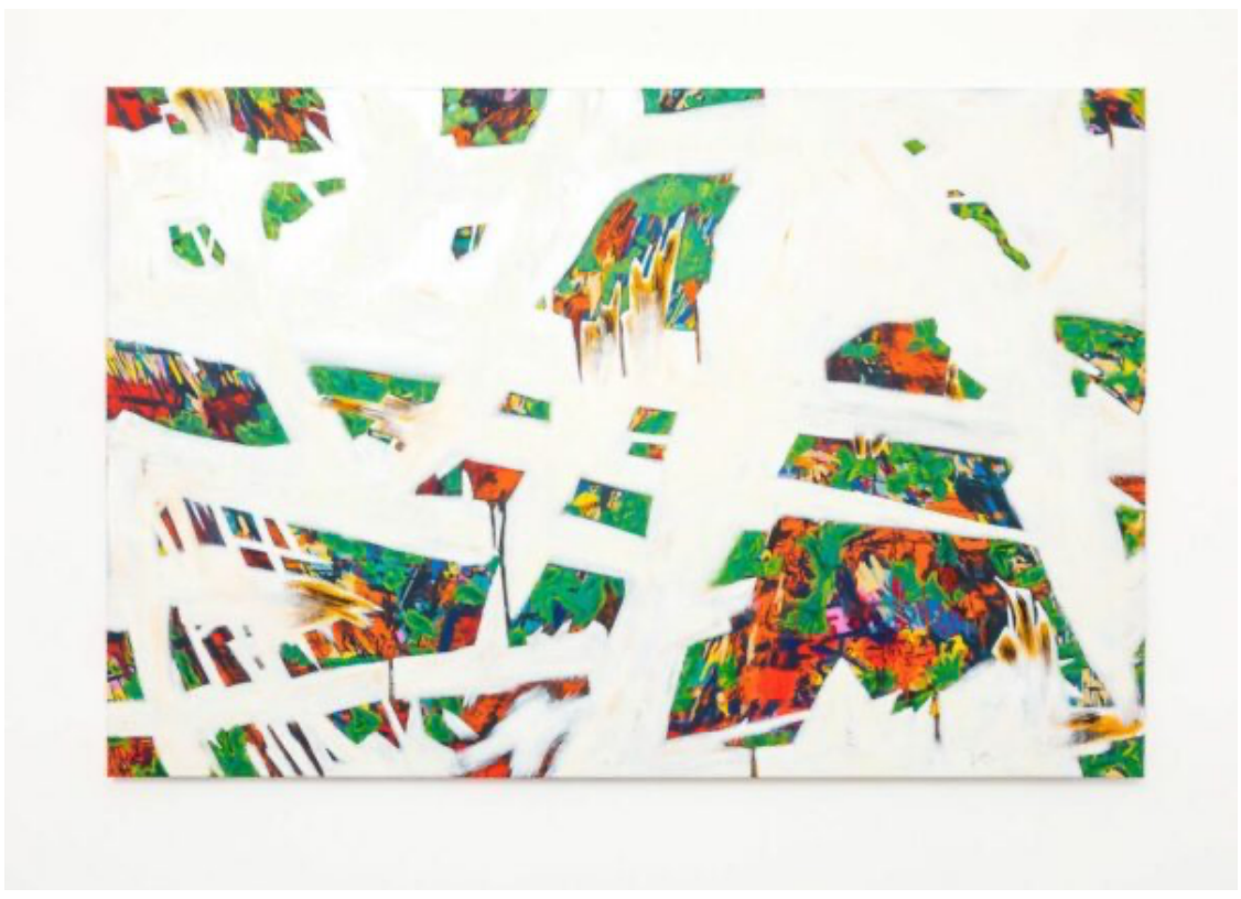
Ruben Nieto Daffy, 2020. Oil on canvas. 50h x 75w in

Over a field of protoplasmic color dominated by greens and oranges in potent play, Nieto has wiped out huge passages of the painting with a reckless brush — using fat, sweeping lines like Franz Kline (1910 – 1962). But where Kline dropped black over empty fields of white, Nieto drops white over pre-existing imagery — pulling off a feisty act of self-sacrifice. It's a bit like the accursed rush that the crazed Hungarian, Laszlo Toth, took at Michelangelo's Pieta with a hammer in 1972, or Robert Rauschenberg's fevered elimination of the marks of an Abstract Expressionist great in his 1953 Erased de Kooning .