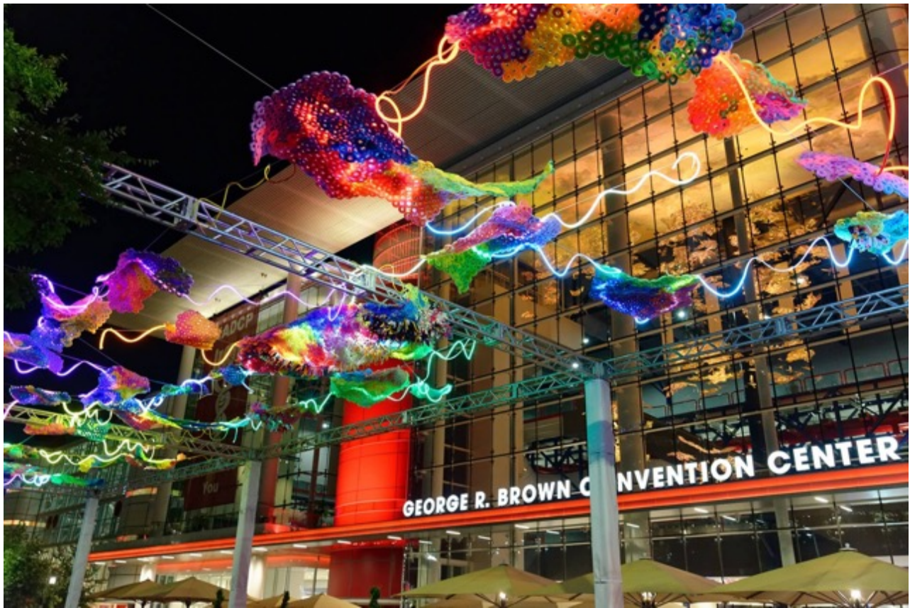
Green Chromatic Fields

Andea recognises that every major art installation consists of two main operations: one is the logistics and the other one is the creative part. If the former occupies her chiefly, then during the latter process, “When I assemble on the site all the structural units (mostly all finished before in my studio), I prefer to work alone and find my zen and ignore distractions in a public space . It is a balance hard to find when the most inner creative force meets the outside world. The installation as an art form needs to be created in the actual space of the exhibition .”