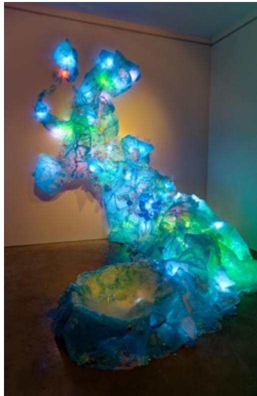
Passage through the frozen dusk

The glaring shift in the environment, causing an unhealthy balance, still remains outside the clear sight of the vision for many. Illuminating upon these changes are the kinetic light sculptures by the Texas-based new media artist , Adela Andea. The industrial electronic components such as light and plastic, designed in incongruent structures, offer organic shape to the installations. At the core of her artistic ideas lies the social responsibility for research that can ensure technological progress and ecological balance. Inspired by “nature, natural versus artificial concepts; environmental issues and technological advances”, the artist aspires to blend aesthetically the romantic notion of nature with the manmade aesthetic.