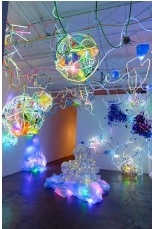
The Northern Lights