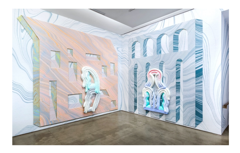
Windows and Walls, 2018, solo exhibition at Asya Geisberg Gallery, New York, NY