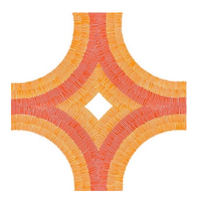
Robert Lansden, Wheel of Time 1 (detail), 2020 watercolor on paper, 38h x 38w in