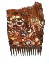
Celia Eberle Harlot , 2013 copper & bird's eye agate 5 of 7