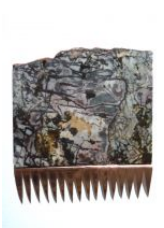
Celia Eberle Harlot , 2013 copper & outback jasper 4 of 7