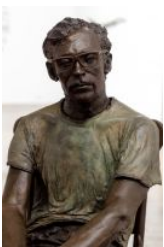
Harry Geffert Self Portrait , ca. 1995 cast bronze with patina 48h x 26w x 48d in