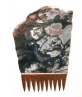
Celia Eberle Harlot , 2013 copper & green moss agate 6 of 7