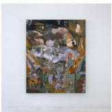
Joshua Hagler Trace of the M(O)ther IV , 2019 oil, mixed media on canvas 60h x 48w in