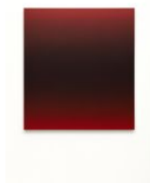
Kristen Cliburn Of Fire I (Homage to James Baldwin) , 2020 acrylic on canvas 45h x 41w in