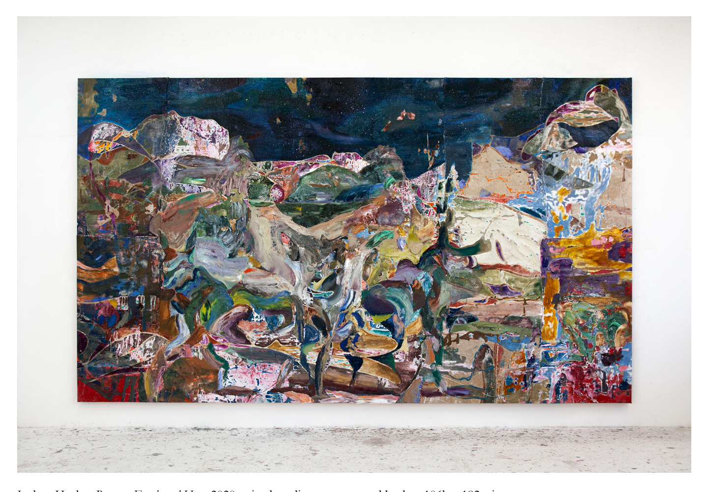
Joshua Hagler, Between Earth and Here, 2020, mixed media on canvas and burlap, 106h x 182w in